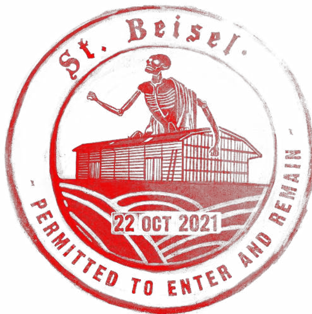
© Fig.: Studio Beisel, untitled, 2021

Under the title St. Beisel , Laurenz Raschke (*1989 in Halle/Saale, Germany) and Kajetan Skurski (*1991 in Gdynia, Poland) have created a walk-through installation that transforms the entire 400 m 2 exhibition space into an artificially constructed world that lies somewhere between this world and the one beyond. Between now and 9 January 2022, visitors are invited to embark on their own personal pilgrimage: "Are you ready?"