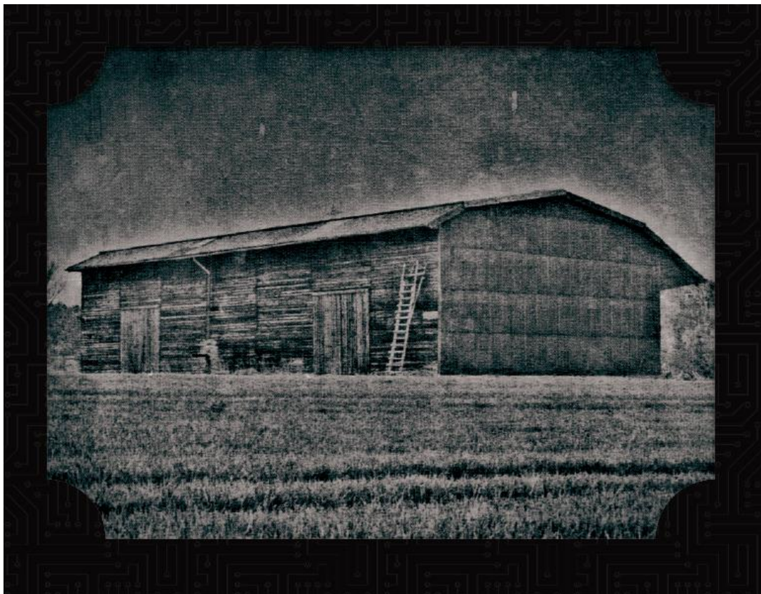
© Fig.: Studio Beisel, Detail from the pilgrim's passport, 2021

Conceptually, Studio Beisel also connects the world beyond with the world here, the sacred with the profane. Depending on the language of origin, Beisel can mean dive bar or pub in Austrian, kennel or brothel in Czech and skittle alley or house in Yiddish. The prefix Saint in the exhibition title St. Beisel , conversely, denotes something sacred. With this neologism, the artists reveal that the special or sacred lies, as is so often the case, in the simple, the overlooked and the all too commonplace. This also explains why the wooden barn, which was erected as the central object in the Kunsthalle, is more than it seemingly appears to be.