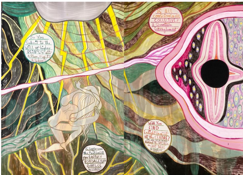
Fig.: Emma Talbot, The Human Experience (Your Birth), Detail, 2023, Courtesy The Artist + Galerie Onrust + Petra Rinck Galerie