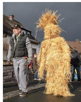
Fig.: Matthew Cowan, The Strawbear , 2019

In his exhibition, which was shown at the Kunsthalle Giessen and the Oberhessisches Museum in 2019, the New Zealander processed various customs from Giessen and the surrounding area and placed them in the context of contemporary art. His e-publication will be presented at the Oberhessisches Museum in January.