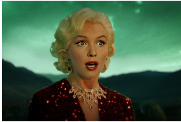
Fig.: Rachel Maclean: DUCK , film still, 2023, © Rachel Maclean

This July, the Scottish artist Rachel Maclean (*1987 Edinburgh, GB; lives in Glasgow, GB) will transform the Kunsthalle Giessen into a 'walk-in' Gesamtkunstwerk. Her multimedia practice centres around virtual realities, deepfakes and photographic techniques that she employs in order to bring garish, fantastical narratives to life. Fuelled by politics and pop culture, Maclean develops satirical societal parodies that address digitalisation, gender and capitalism. Opulent and elaborately staged, the artist creates immersive environments and paintings in which the lines between the two-dimensional and tangible space become blurred. Maclean uses her deepfakes to negotiate current issues such as the consumption of news from unverified sources.