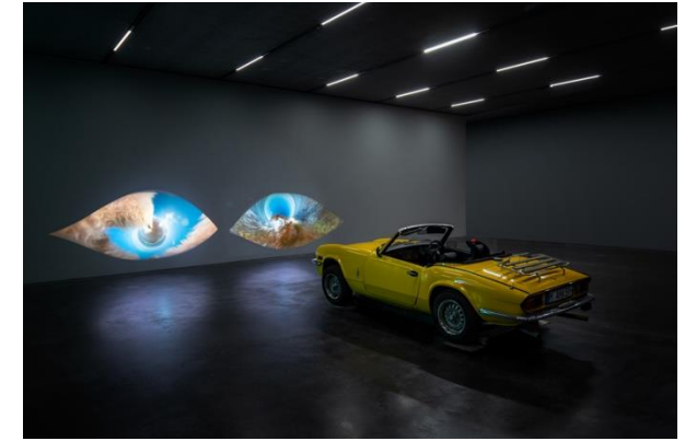
Fig.: Raphaela Vogel, A Woman's Sports Car , 2018, Installationsansicht De Pont Museum, Tilburg

Sculptural sound and video collages as well as installations that interact with architectural and natural conditions stand at the centre of Raphaela Vogel's work (*1988 Nuremberg, lives in Berlin). Spatial experience is an essential part of her artistic practice, meaning that Vogel's work can never be viewed in isolation of its surroundings. To achieve this, the artist favours the use of found objects that she adapts and repurposes. Thus, Vogel disrupts their original function while lending them a new symbolic power.