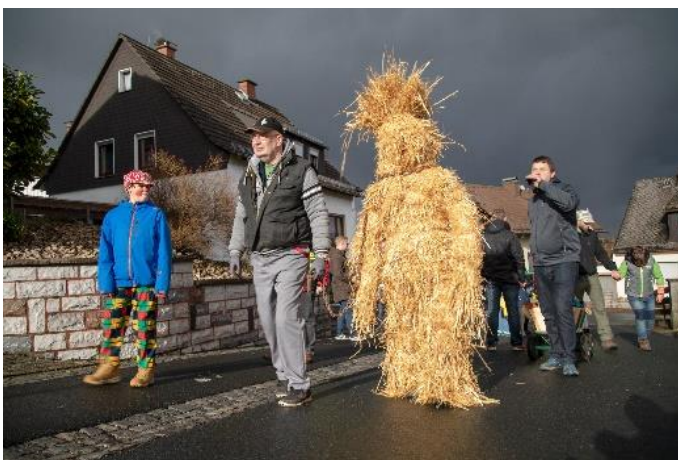
Fig.: Matthew Cowan: The Strawbear, 2019

Matthew Cowan's recent online publication and his new editions will be presented as a follow-up to his solo show The Scream of the Strawbear . In his photographs, videos, installations and performances, the New Zealander explores European customs and the role they play today. Rituals, dresses and costumes are central to these endeavours. His own editions will be presented amidst the cultural-historical objects on display at the Oberhessisches Museum. The exhibition was held from 07.09. –